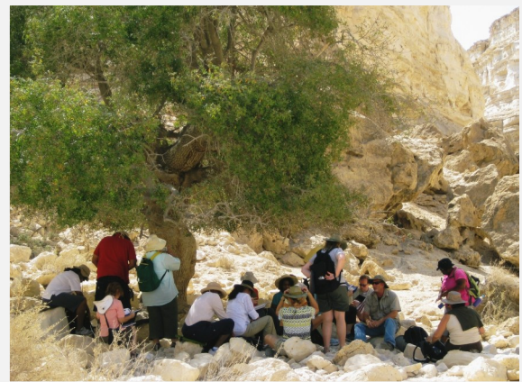
Wilderness of Zin— Israelites wandered 40 yrs. here