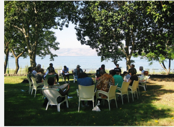
Team having class looking out at Sea of Galilee