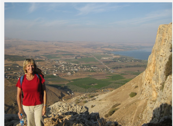
Arbel Cliffs overlooking Magdala & Capernaum