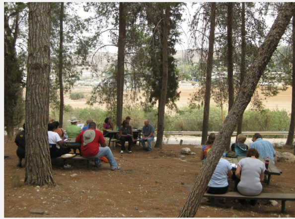
Class at the Valley of Elah (David & Goliath)

Airfare: Costs based on rates at the time of purchase