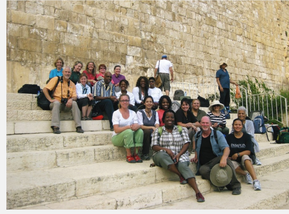
2011 Team (Rabbinical teaching steps, Temple Mt.)