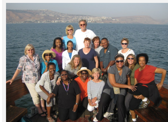
2010 Team (boatride & class on Sea of Galilee)